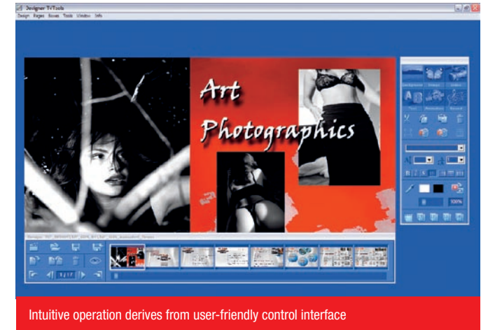
Intuitive operation derives from user-friendly control interface

The distribution and planning of your content is achieved simply and cost-effectively via an IP connection. The Player is able to control several displays with its one signal.