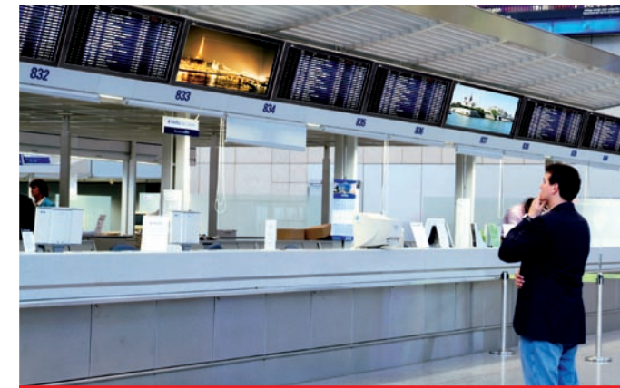
Flexible utilisation of your displays as information panels and advertising space.

This and other state-of-the-art technology deployed by TV-Tools make it possible to present your communications in new and highly effective ways. Bring your customers' attention to the latest news items which are relevant to them, e.g. stock market changes, sports results or weather & traffic reports. At the same time and on the same displays you can also be promoting your company with repeat reminders about your products or services. It is a proven fact that the brain is more likely to remember the content of a sentence if it has been read at least three times.