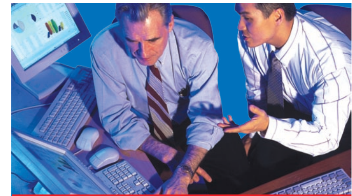
Control as many displays as you like – from a central point with a complete system overview