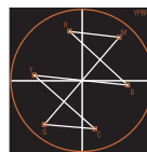
Vector Scope (V.S.) with color bar displayed

The vector scope is used for checking the input signal's hue and saturation. The displayed scope can be displayed in one of two sizes for ease of use. The waveform monitor detects the brightness of the input; its display position can be selected from one of four corners. Both displays can be made translucent or solid for simultaneous checking of the image and the scope/waveform.