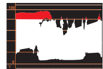
Example of a Wave Form Monitor